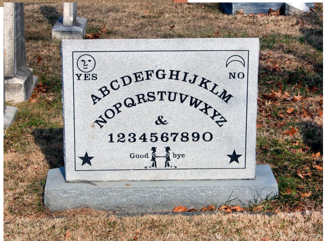
The inventor of the Ouija board lived and died in Baltimore; his tombstone stands as a reflection of his achievement.