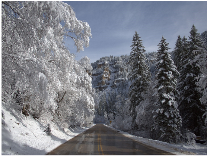
In 1943, the temperature in Spearfish, South Dakota jumped 49 degrees in two minutes (-4°F to 45°F), one of the most drastic changes on record.