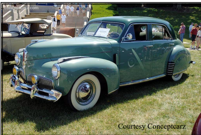
1941 Studebaker Commander Landcruiser