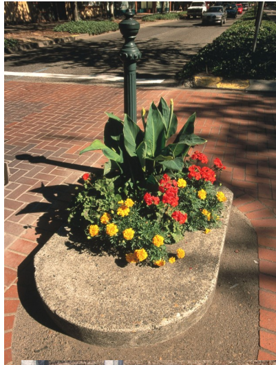
The world's tiniest park is in Portland, measuring a mere two feet wide.