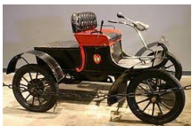
See you on the tours.