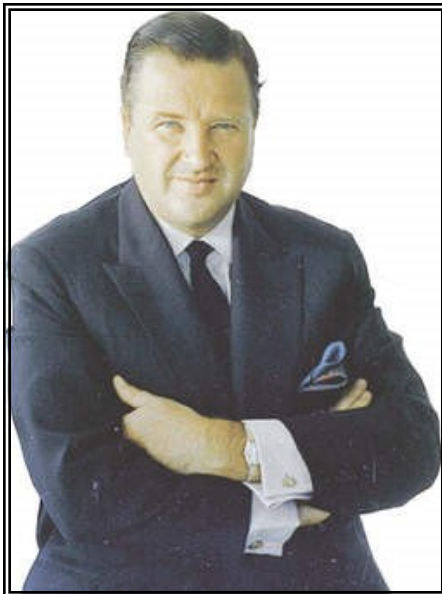
Henry Ford II

As we learned in the last issue, in the early '50s, Studebaker's sales were falling at an alarming rate. With their all new "Car of the Future", the beautiful Loewy Coupe, 1953 and '54, should have been banner years for the company. However, by 1954 sales had dropped drastically to a mere 68,708 units, about twenty percent of sales just four years earlier. There were a number of reasons for the drop in sales, and we'll take a look at them in a "postmortem" issue. However there was one problem that brought Studebaker sales to a screeching halt, and that problem was not in South Bend. As a matter of fact, the problem was over two-hundred miles away in Dearborn Michigan. The problem was in the person of Henry Ford II. During WWII, mismanagement at the Ford Motor Company was responsible for the loss of no less than $10 million a month. The U.S. government, concerned that the vital Ford dynasty would fail, called Henry Ford II (Edsel's son and Henry's grandson), home from the navy to save the failing company. In 1945, Ford II assumed the role of president, and the daunting task of saving the company was underway. Soon the company experienced a turnaround, and was once again a money maker. However, that wasn't enough for the younger Ford. It had never set well with the Ford family that Chevrolet had taken the number one sales position. Ford was determined to take the lead once again at