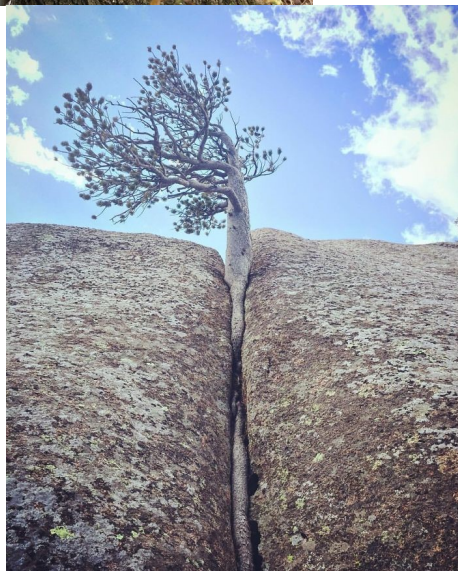
Life,Uh... Finds A Way