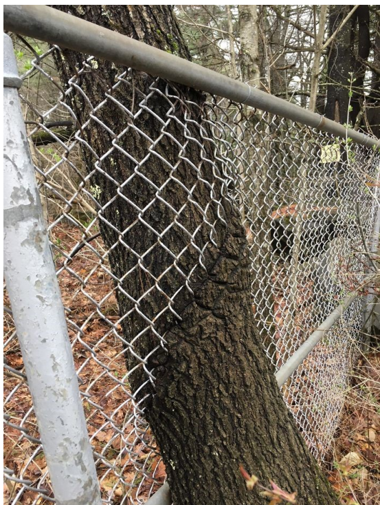
This Tree Growing Through A Fence