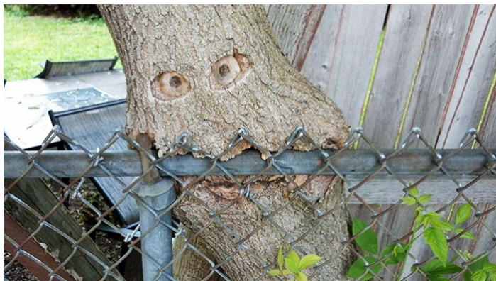
My Sister's Tree Is Eating Her Fence