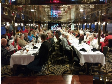
Pin-MAR Christmas Banquet