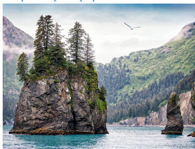
In 1872, Russia sold Alaska to the United States for about 2 cents per acre.