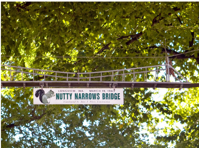
There's a town in Washington with treetop bridges made specifically to help squirrels cross the street.