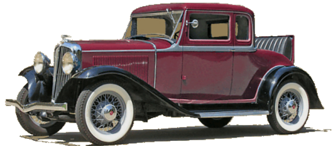
1932 Rockne by Studebaker