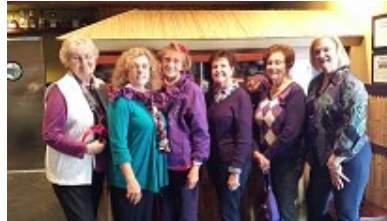
Classie Lassies at Rhumba's in January.

The Classie Lassie gathered at Rumba's on January 20 for a delightful lunch with the red hat ladies, who just like to have fun together.