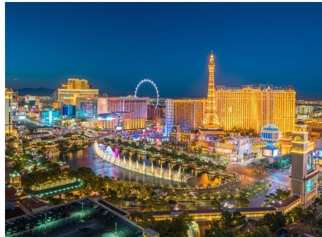
It would take you more than 400 years to spend a night in all of Las Vegas's hotel rooms.