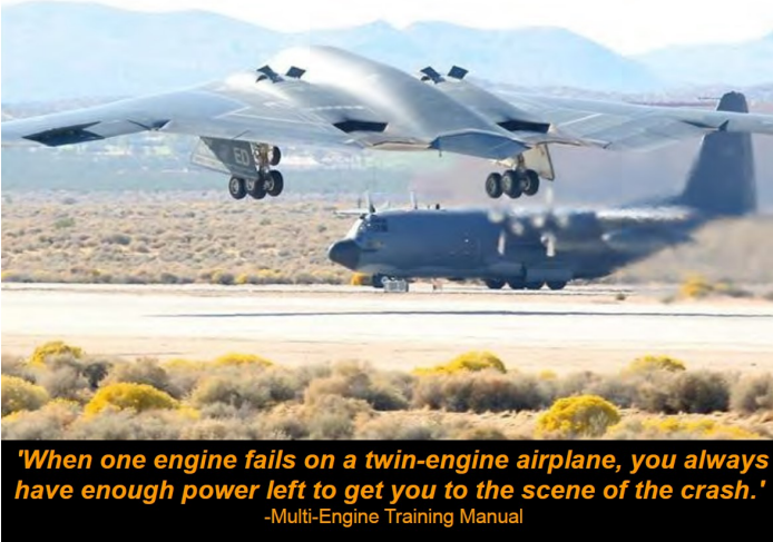
B-2 Spirit & C-130 Hercules

'When one engine fails on a twin-engine airplane, you always have enough power left to get you to the scene of the crash.' -Multi-Engine Training Manual