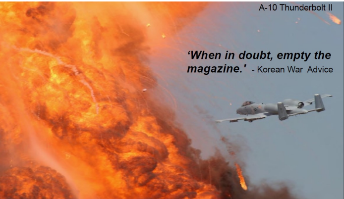
A-10 Thunderbolt II

'When in doubt, empty the magazine.' - Korean War Advice