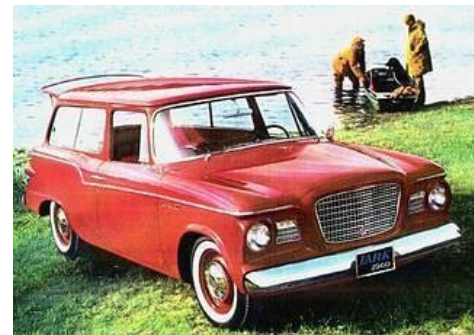
1960 Lark Station Wagon. Studebaker only built a two-door wagon in 1959, a major mistake, since buyers wanted four-door wagons. In 1960, the company introduced a four-door wagon

Other models—2-Door Sedan, Hardtop and Station Wagon. Automatic transmission optional on all models.