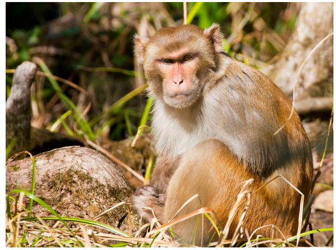
There's an island full of wild monkeys off the coast of South Carolina called Morgan Island, and it's not open to humans.