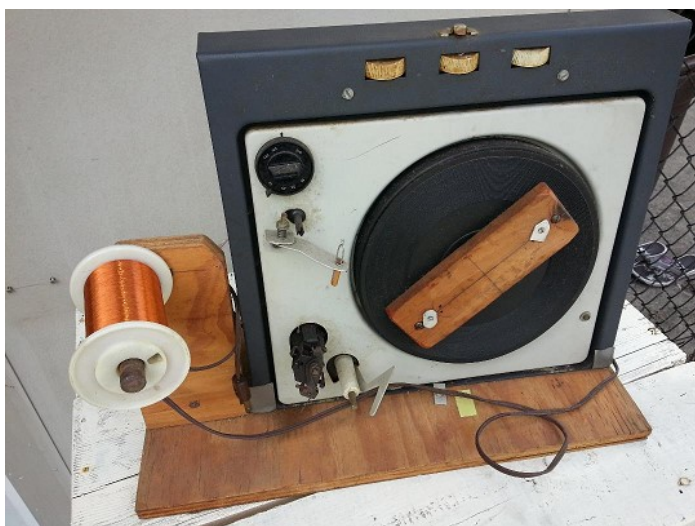
Dad's automatic coil-winding machine.