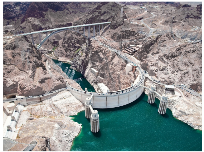
There's enough concrete in the Hoover Dam to build a two-lane highway from San Francisco to New York City.