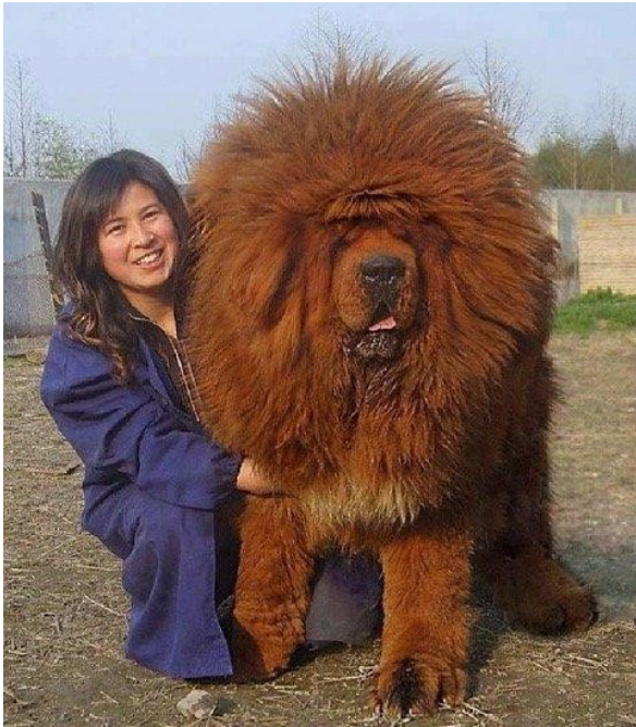
Dog For Sale. Excellent Guard Dog.

Whether you own a dog or not, you must appreciate the efforts of this owner trying to sell her dog. Look at the picture of this lovable Chinese Mastiff and then read the sales pitch below.