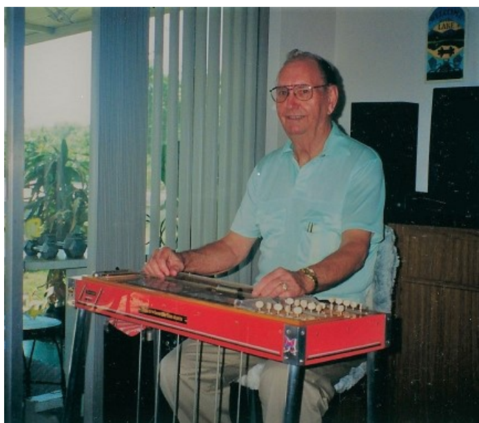
Dad playing one of the pedal steel guitars he built.