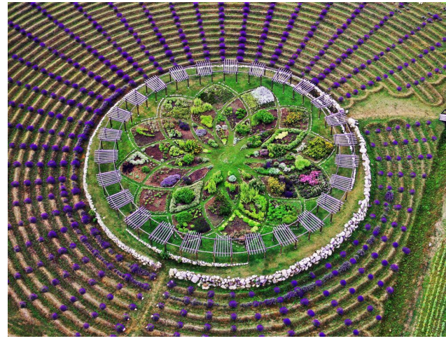
Western Michigan is home to a giant lavender labyrinth so big you can see it on Google Earth.