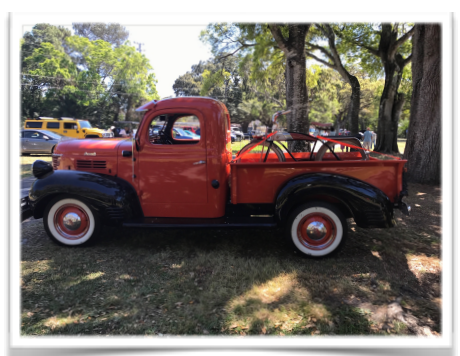
1941 Plymouth PT-125