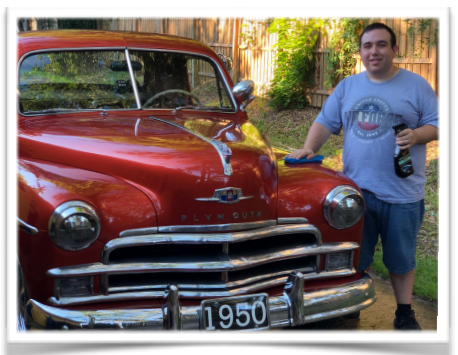
1950 Plymouth Businessman Coupe