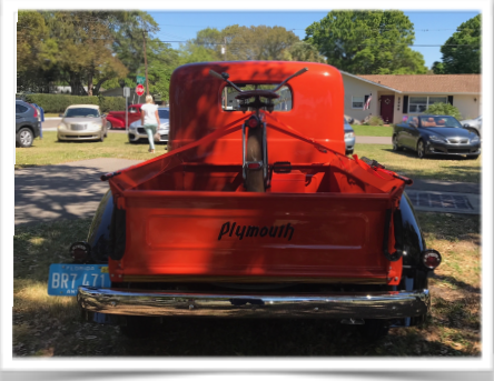
1941 Plymouth PT-125