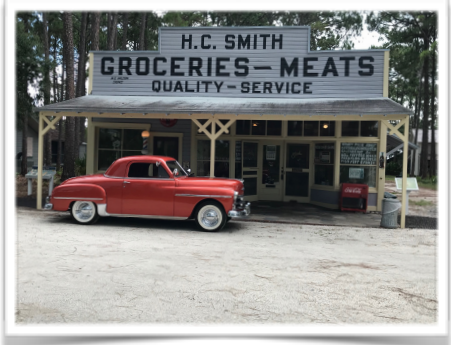
1950 Plymouth Businessman Coupe