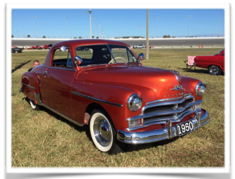
1950 Plymouth Businessman Coupe