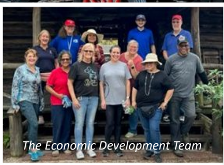
The Economic Development Team

Pinellas County Economic Development for participating in the County Inservice Day on Feb. 20 by volunteering at Heritage Village to help preserve local history.